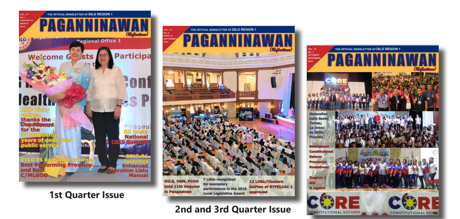
4th Quarter Issue