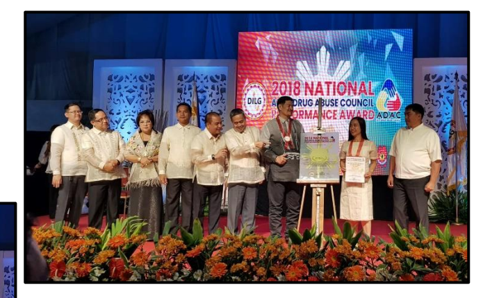
Page 1 of 30