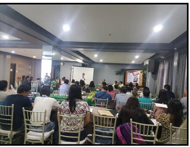
SGLG Provincial Roll-out