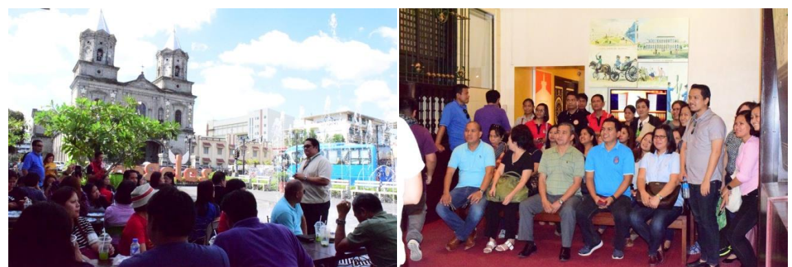
Knowledge Management Journey in Angeles City, Pampanga