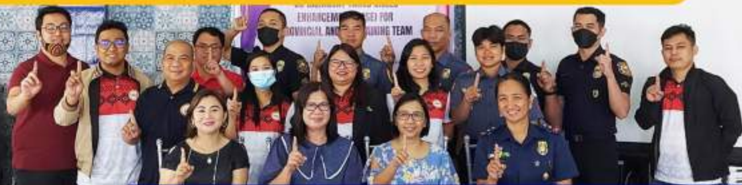
TRAINING OF TRAINERS ON BARANGAY TANOD SKILLS ENHANCEMENT (BTSE) FOR PROVINCIAL AND ICC TRAINING TEAM