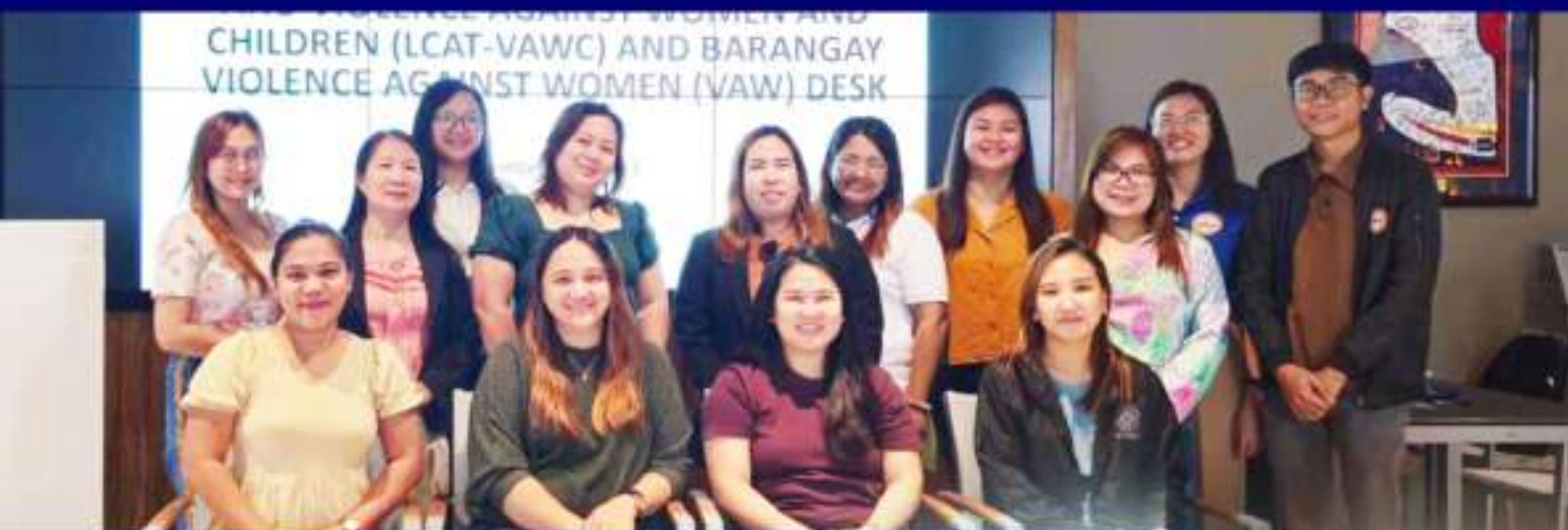
ORIENTATION ON THE ENHANCED GUIDELINES FOR THE OPERATIONALIZATION OF THE LCAT-VAWC AND BVAW DESK