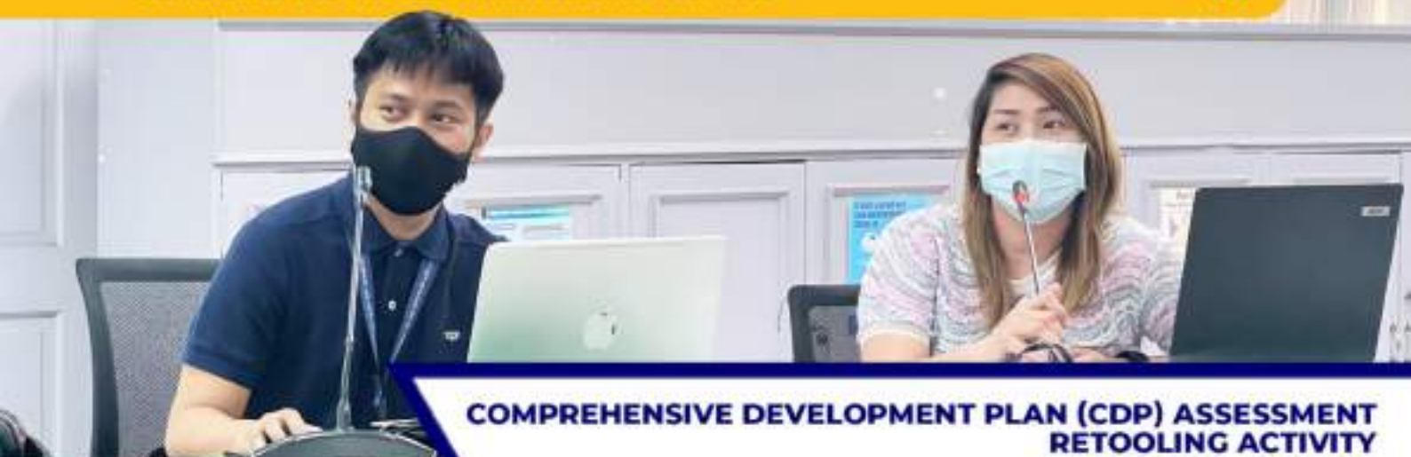
COMPREHENSIVE DEVELOPMENT PLAN (CDP) ASSESSMENT RETOOLING ACTIVITY