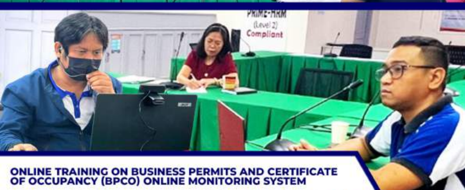
ONLINE TRAINING ON BUSINESS PERMITS AND CERTIFICATE OF OCCUPANCY (BPCO) ONLINE MONITORING SYSTEM