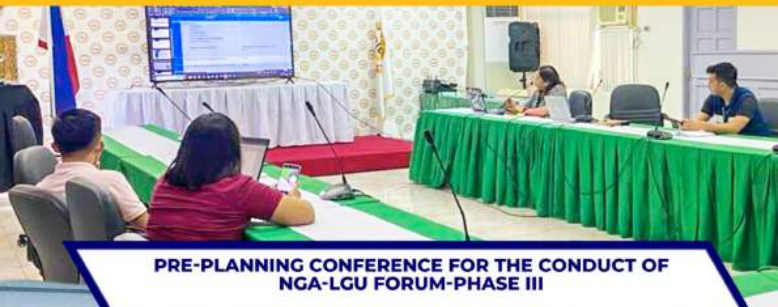
PRE-PLANNING CONFERENCE FOR THE CONDUCT OF NGA-LGU FORUM-PHASE III