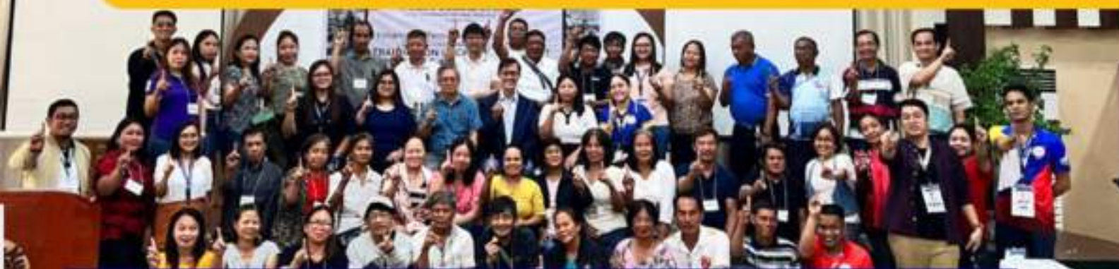
Training on Local Development Planning and Local Budget Process for CSOs in Local Development Council